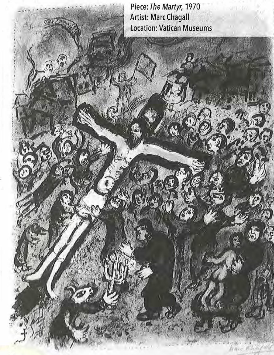
Piece: The Martyr , 1970

In the Eucharist, Jesus comes down to you today to carry your