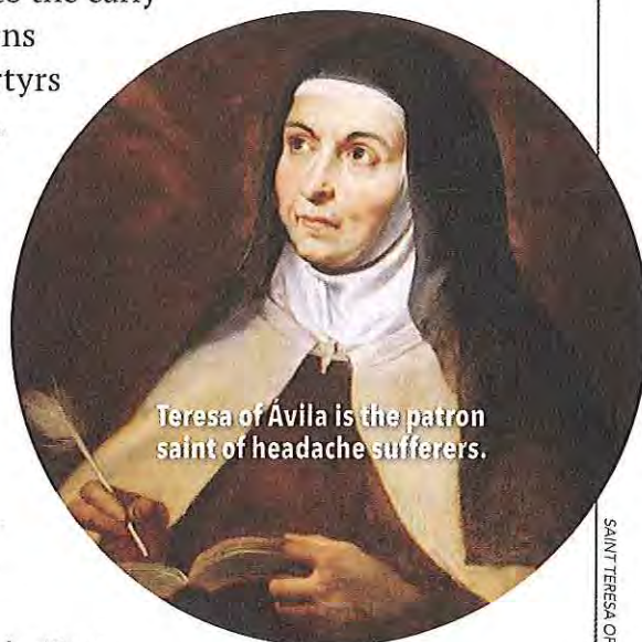
Teresa of Avila is the patron saint of headache sufferers.

If you wish to see a searchable listing of all the patron saints, a good place to go is catholic.org/saints/patron.php . May your patron saint always watch over you and protect you!